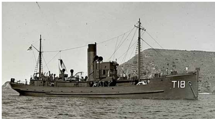
The HMNZS Rimu in 1941 following its commissioning into service.

The Northern Mercury Bay has a fascinating maritime history and one of the more interesting stories I have heard about of late was the sinking of the Royal New Zealand Naval vessel HMNZS Rimu off Cuvier island in August 1958.